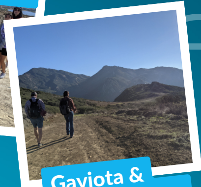
Gaviota & Santa Barbara Coastlines